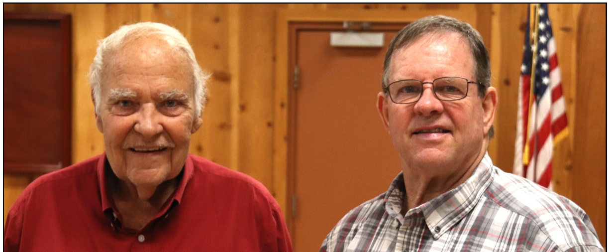
Sirs with birthdays in August who attended.

ALL PHONE NUMBERS LISTED ARE IN AREA CODE 530 UNLESS OTHERWISE INDICATED