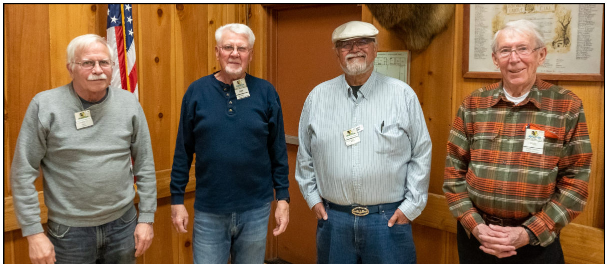
Sirs with birthdays in April who attended.