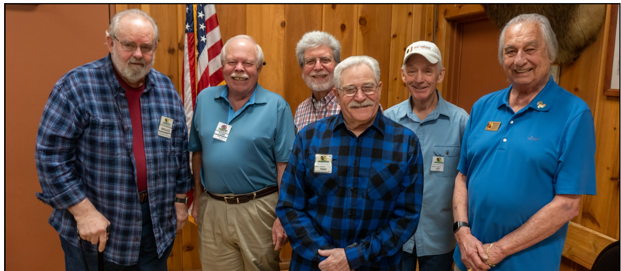
Sirs with birthdays in February who attended.

ALL PHONE NUMBERS LISTED ARE IN AREA CODE 530 UNLESS OTHERWISE INDICATED