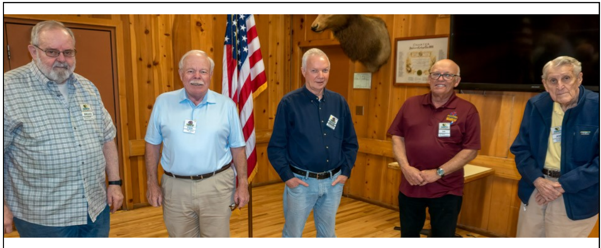
Sirs with birthdays in February who attended.

ALL PHONE NUMBERS LISTED ARE IN AREA CODE 530 UNLESS OTHERWISE INDICATED