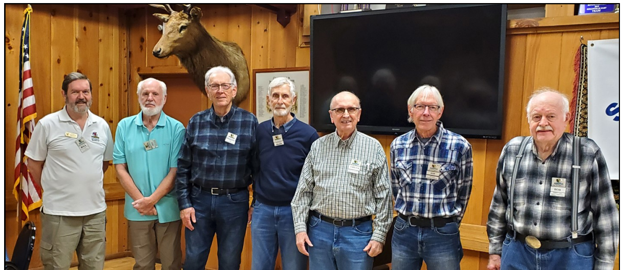
Sirs with birthdays in March who attended.

ALL PHONE NUMBERS LISTED ARE IN AREA CODE 530 UNLESS OTHERWISE INDICATED