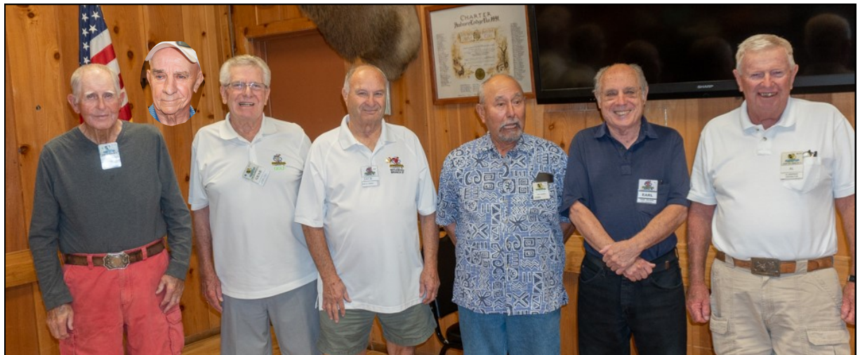
Sirs with birthdays in October who attended.