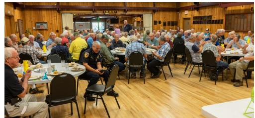
A Good Turnout