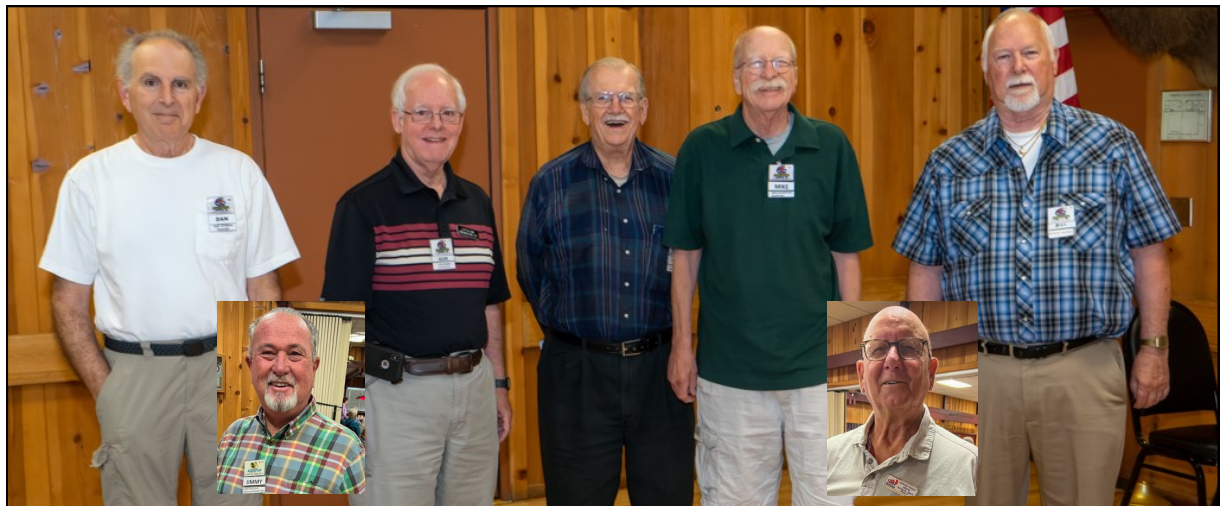
Sirs with birthdays in July who attended.