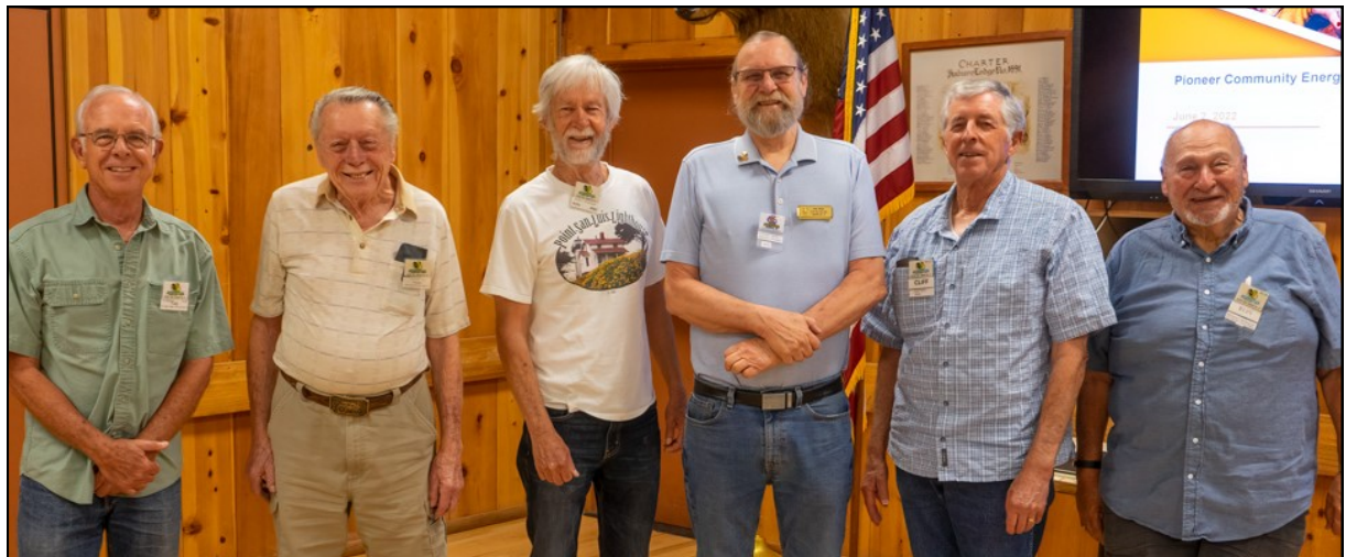
Sirs with birthdays in June who attended.

ALL PHONE NUMBERS LISTED ARE IN AREA CODE 530 UNLESS OTHERWISE INDICATED