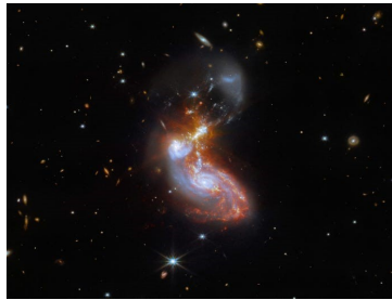
A merging pair of galaxies that Webb captured.