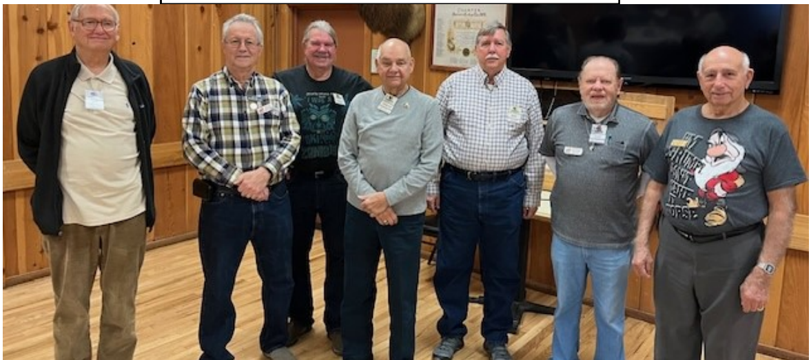
Sirs with birthdays in December & January who attended.

ALL PHONE NUMBERS LISTED ARE IN AREA CODE 530 UNLESS OTHERWISE INDICATED