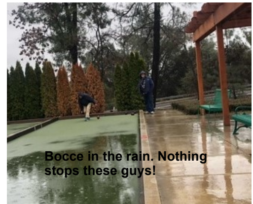
Bocce in the rain. Nothing stops these guys!

Visit the SIR Branch 37 web site at http://sirbranch37.weebly.com/ and For SIR Happenings use the SIR State Website http://sirinc.org/sirhappenings/