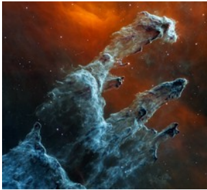
The Pillars of Creation , imaged in Webb's near-infrared-light view.