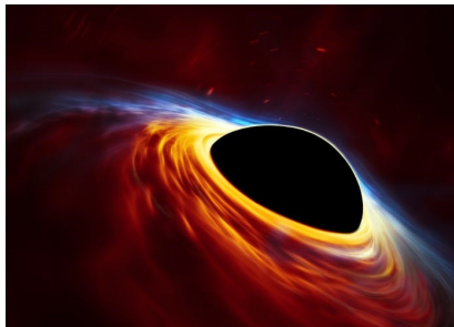
An artist's impression of a rapidly spinning supermassive black hole surrounded by a disc of super-heated material.

Feb 1 Luncheon 11:00 to 1:30 pm Feb 10 Bulletin Material Due Feb 15 Executive Board Meeting 9:00 am @ Original Mel's Dinner 1730 Grass Valley Hwy, Auburn All Sirs Welcome