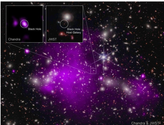
A picture taken by JWST and Chandra X-ray observatory shows the location of a UHZ-1 and its black hole near the beginning of the universe.

Gumbo & Creole Chicken GARDEN SALAD & DRESSING FRESH VEGETABLES BREAD & BUTTER DESSERT COFFEE & TEA