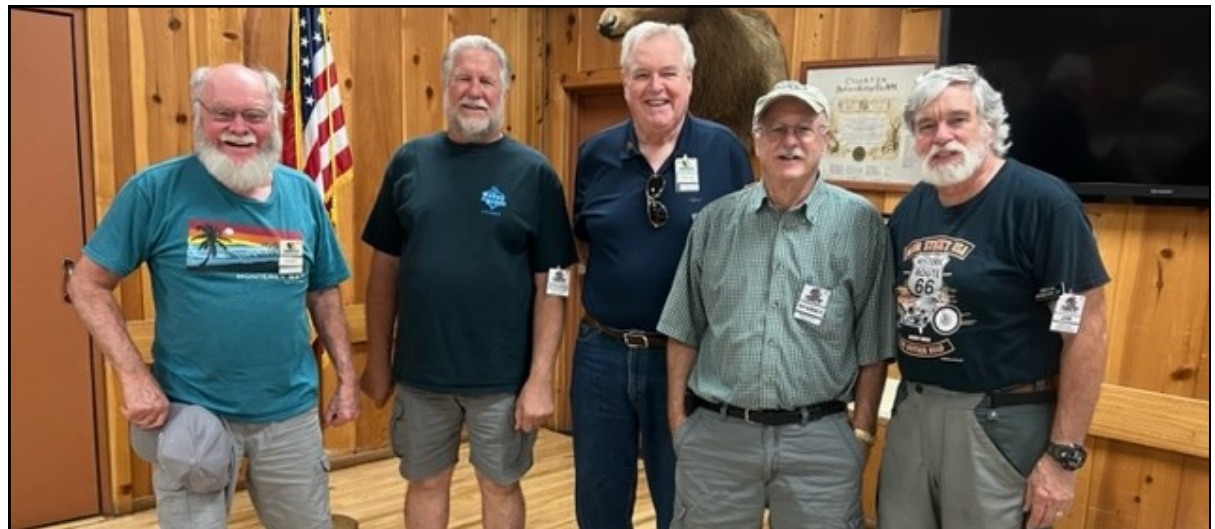
Sirs with birthdays in September who attended.

ALL PHONE NUMBERS LISTED ARE IN AREA CODE 530 UNLESS OTHERWISE INDICATED