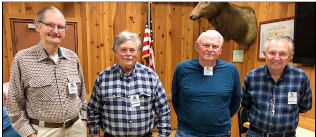
Sirs with birthdays in May who attended.

ALL PHONE NUMBERS LISTED ARE IN AREA CODE 530 UNLESS OTHERWISE INDICATED