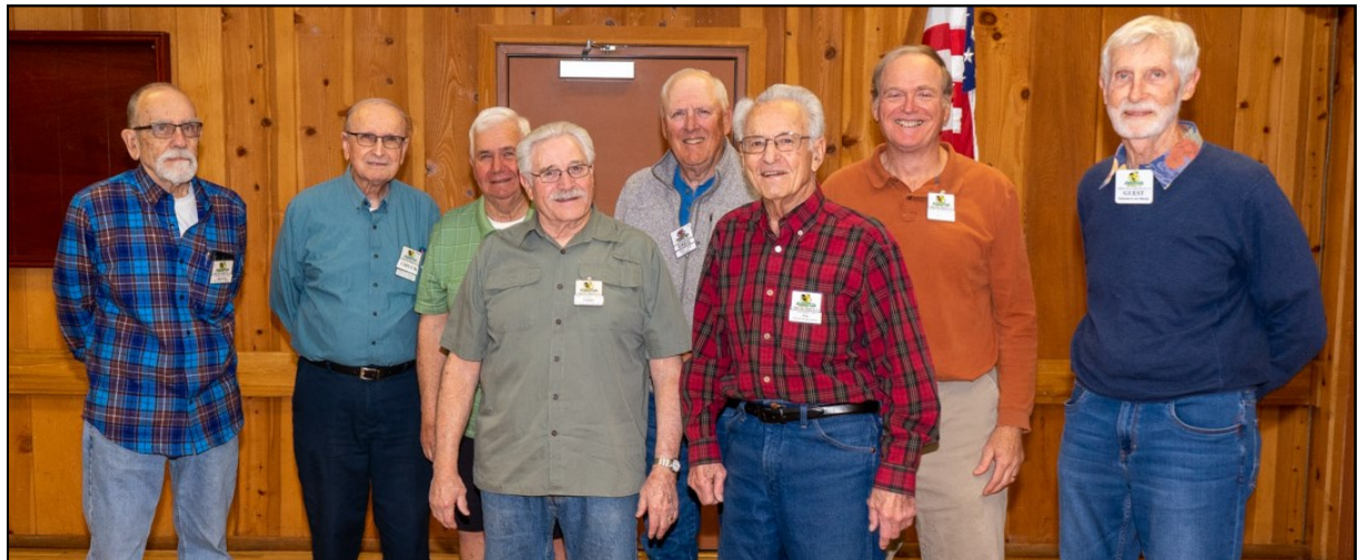
Sirs (BR 37 & 79) with birthdays in March who attended.

ALL PHONE NUMBERS LISTED ARE IN AREA CODE 530 UNLESS OTHERWISE INDICATED