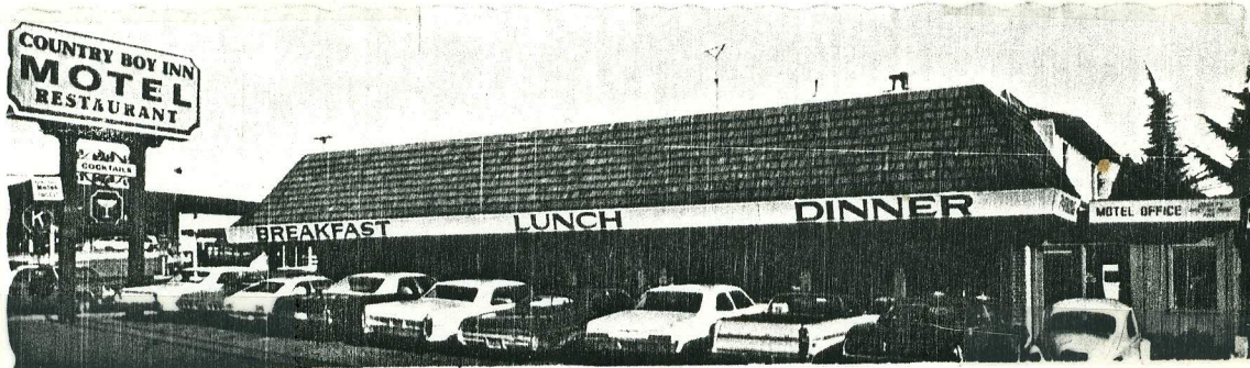
OUR FIRST MEETING PLACE